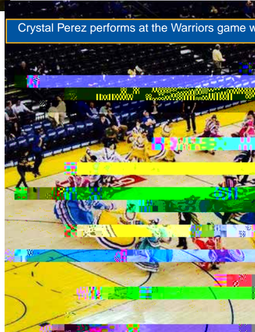
Crystal Perez performs at the Warriors game w